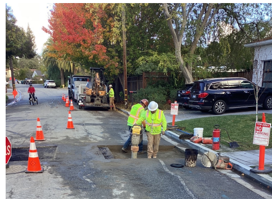
Image 1 - Construction Activities in the ROW

All construction activities within the public right-of-way require a licensed contractor with an appropriate license for the proposed work, issued by the California Department of Consumer Affairs Contractors State License Board.