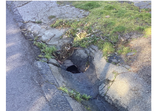
Image 2 - Driveway Culvert

A. San Mateo County does not construct driveway pipes. These pipes have historically been installed by developers or private property owners to facilitate drainage across their driveways. The responsibility for maintenance or repair of privately owned facilities or improvements, such as driveway pipes, rests with the private party involved – typically the property owner.