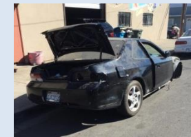
Vehicle Missing Parts