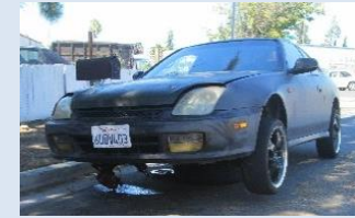
Vehicle being Repaired