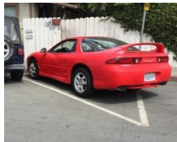
Parking in a NON Parking Spot

22511.7 or 22511.8, unless the vehicle displays either a special identification license plate issued pursuant to Section 5007 or a distinguishing placard issued pursuant to parked in the stall or space.