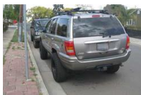
Parking Wrong Way