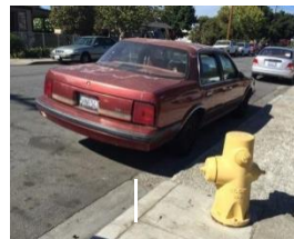
Parking too close to a Fire Hydrant