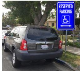
Parking in Disabled Spaces

22507.8. (a) It is unlawful for any person to park or leave standing any vehicle in a stall or space designated for disabled persons and disabled veterans pursuant to Section.