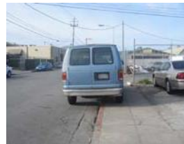
Parking on Sidewalk