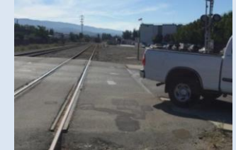
Parking Upon or Near Railroad